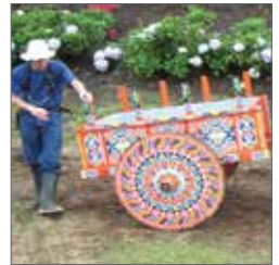
Oxcarts of Sarchí